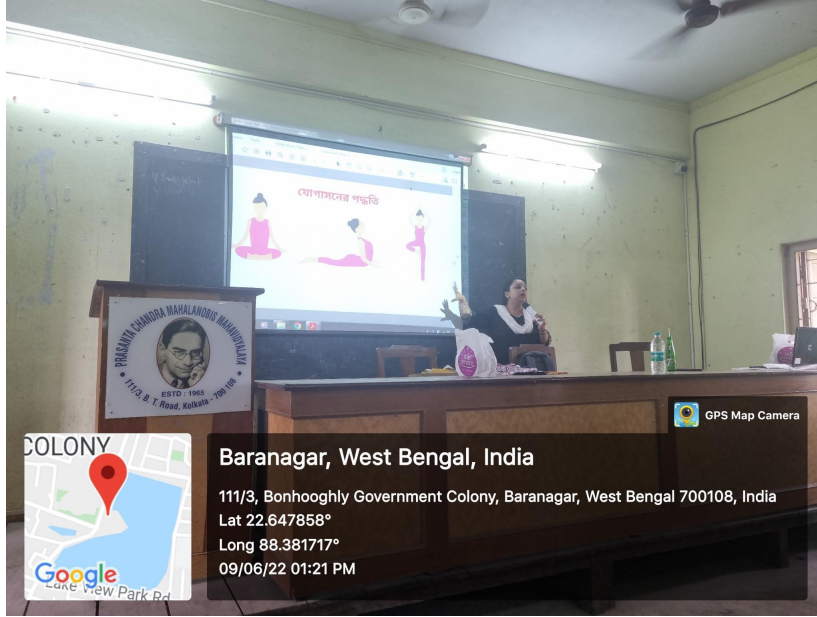
Menstrual Health and Hygiene Workshop in collaboration with Anahat For Change Foundation