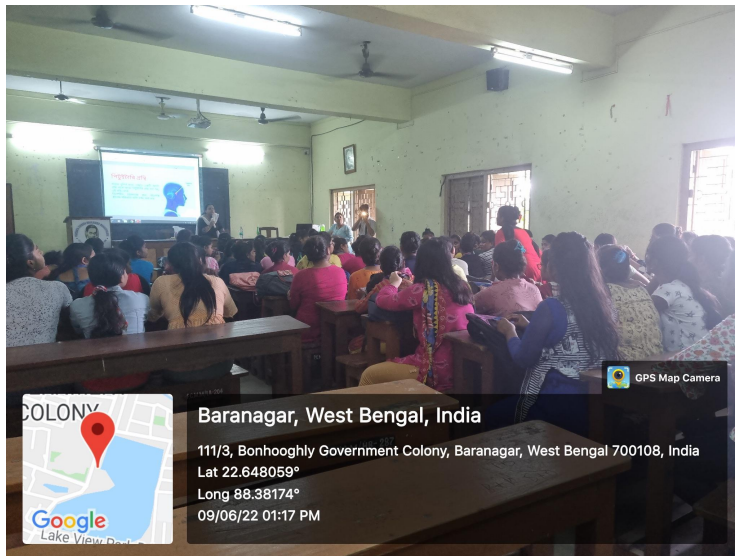
Menstrual Health and Hygiene Workshop in collaboration with Anahat For Change Foundation